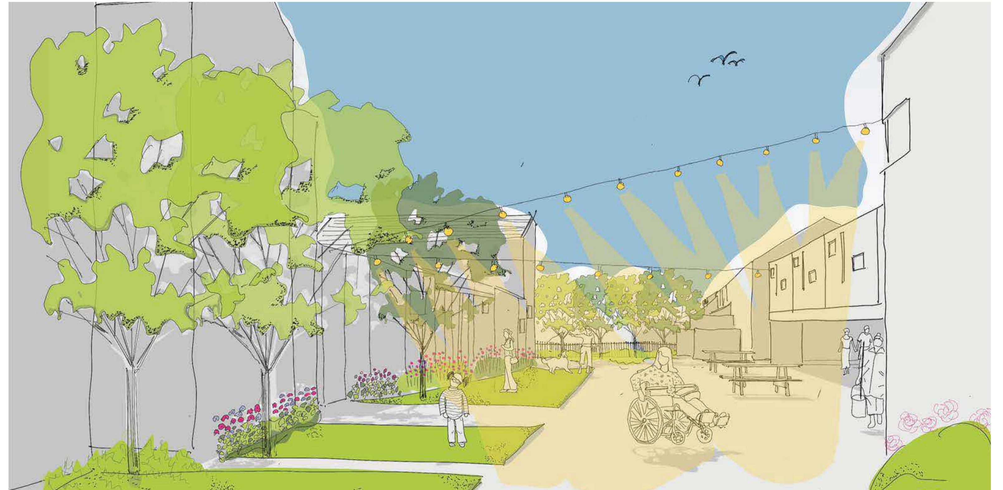
Sketch of proposed amenity space on Cumbernauld Walk

Scan me to let us know what you think of our proposals and find out more about our customer panel