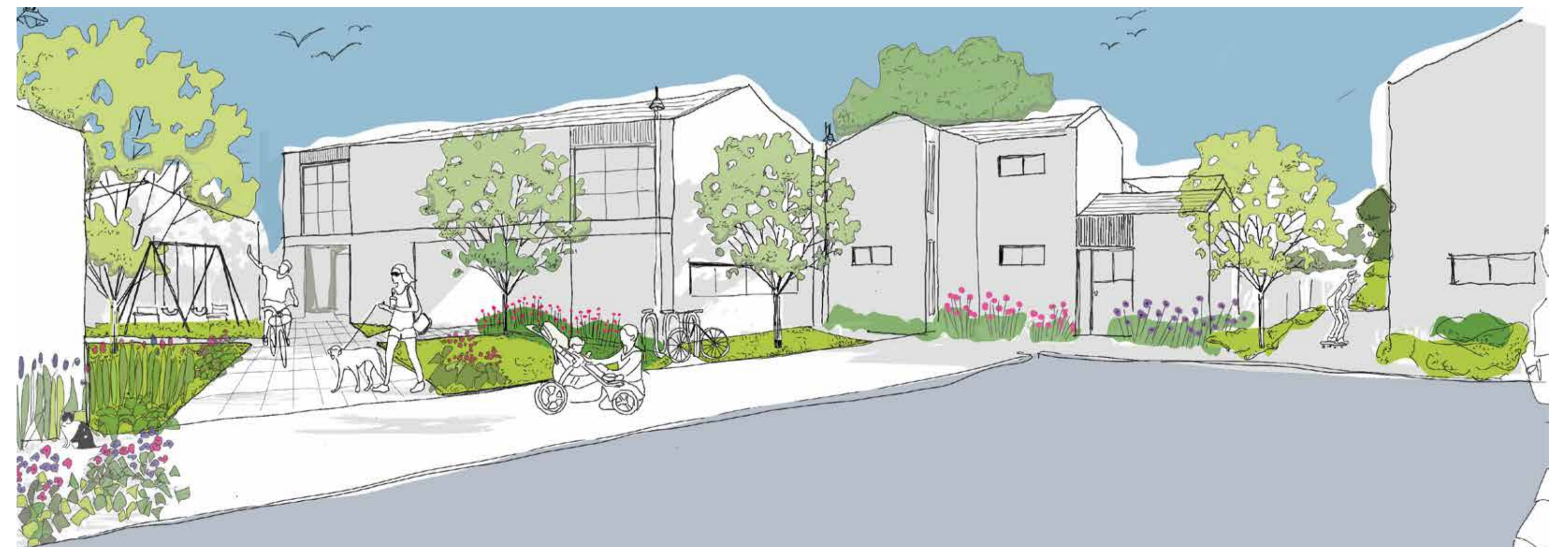
Sketch of proposed amenity on Peterlee Walk with garages removed