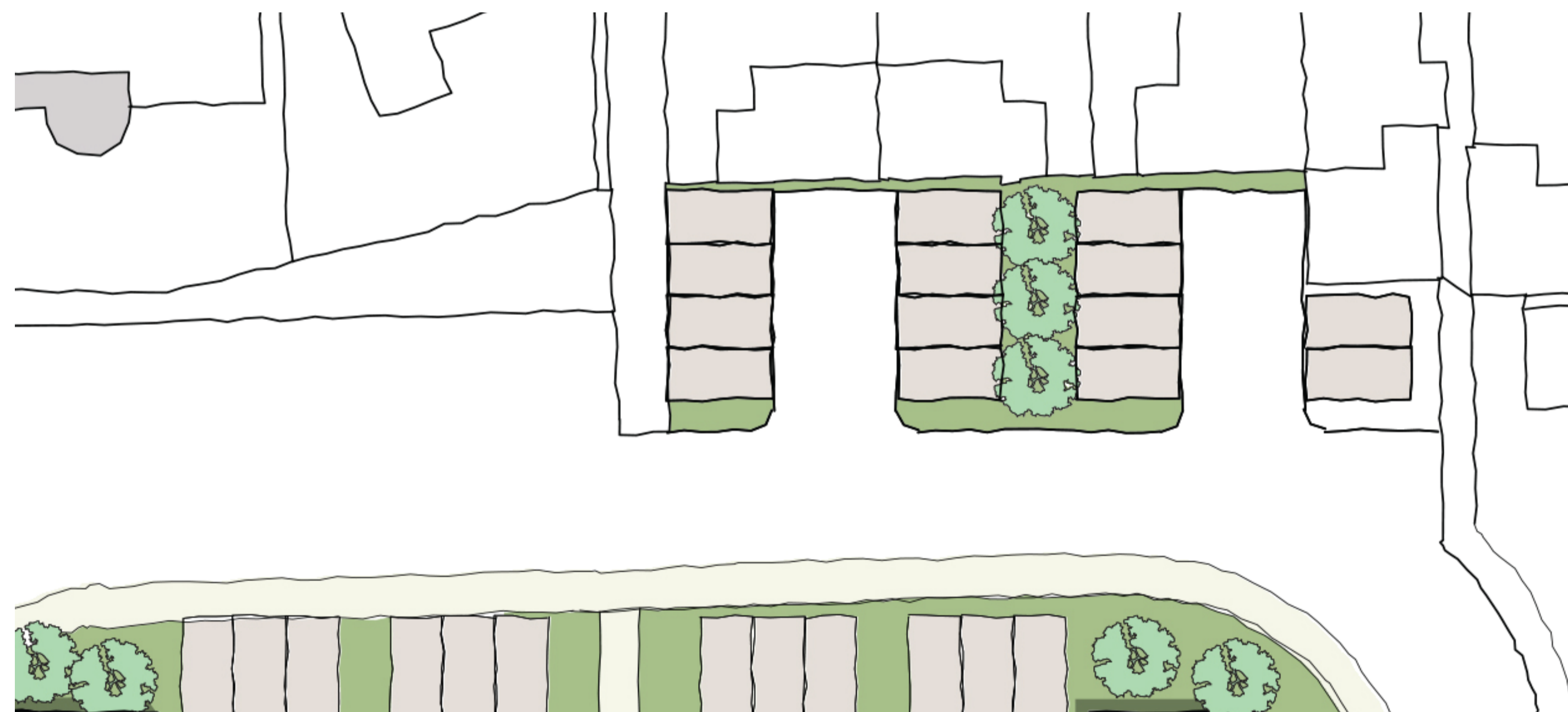
Proposed plan for garages on Boswell Drive